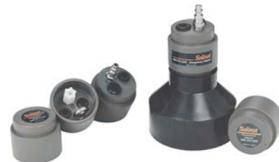
Dedicated Well Caps 2" and 4" (50 mm and 100 mm)

The caps slip easily onto 2" dia. (50 mm) wells. Adaptors to fit 4" dia. (100 mm) or other well sizes are also available. The cap seals in place with an o-ring, and comes with a wire connected protective cover. Low profile wellheads are also available for flush mount casing applications.