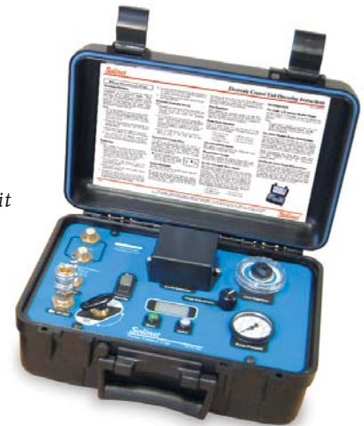
Electronic Control Unit Model 466

The pump is quick to disassemble and the bladders and screens are simple to replace in the field. No tools required. Inexpensive polyethylene bladders can be quickly replaced to suit regulatory requirements.