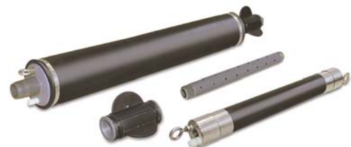
Model 800 Packers 3.7" and 1.8" (94 mm and 46 mm)

Model 800 Low-Pressure Packers can be used with Integra Pumps to minimize purge times by reducing purge volumes. This reduces the cost of water disposal and labour. Packers are available in single point or straddle packer designs, and in sizes to fit 2" (50 mm) to 5" (127 mm) dia. wells. (See Model 800 Data Sheet.)